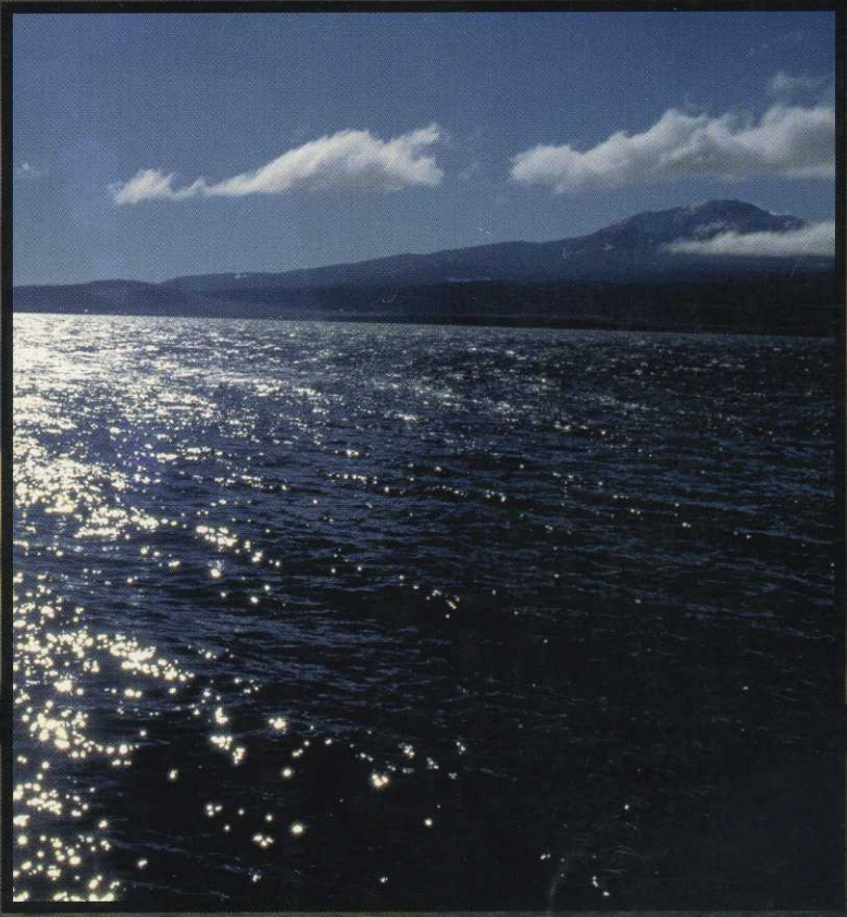
Henry's Lake